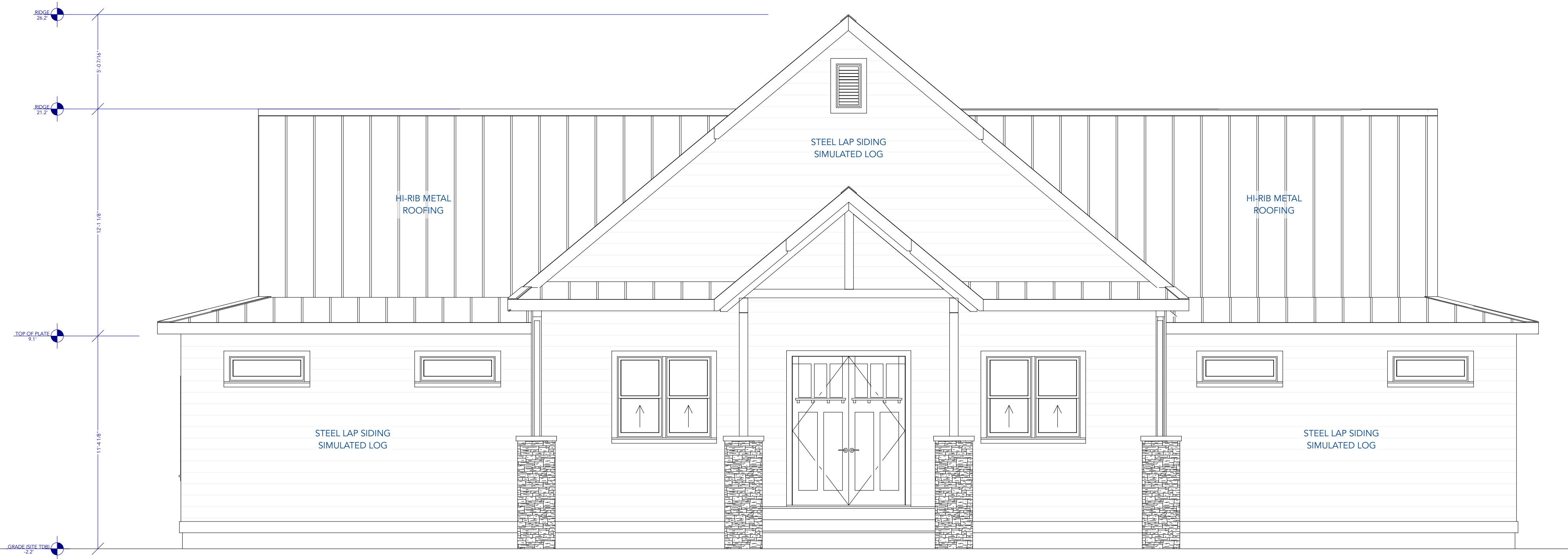
FRONT ELEVATION SCALE: 1/4" = 1 FOOT