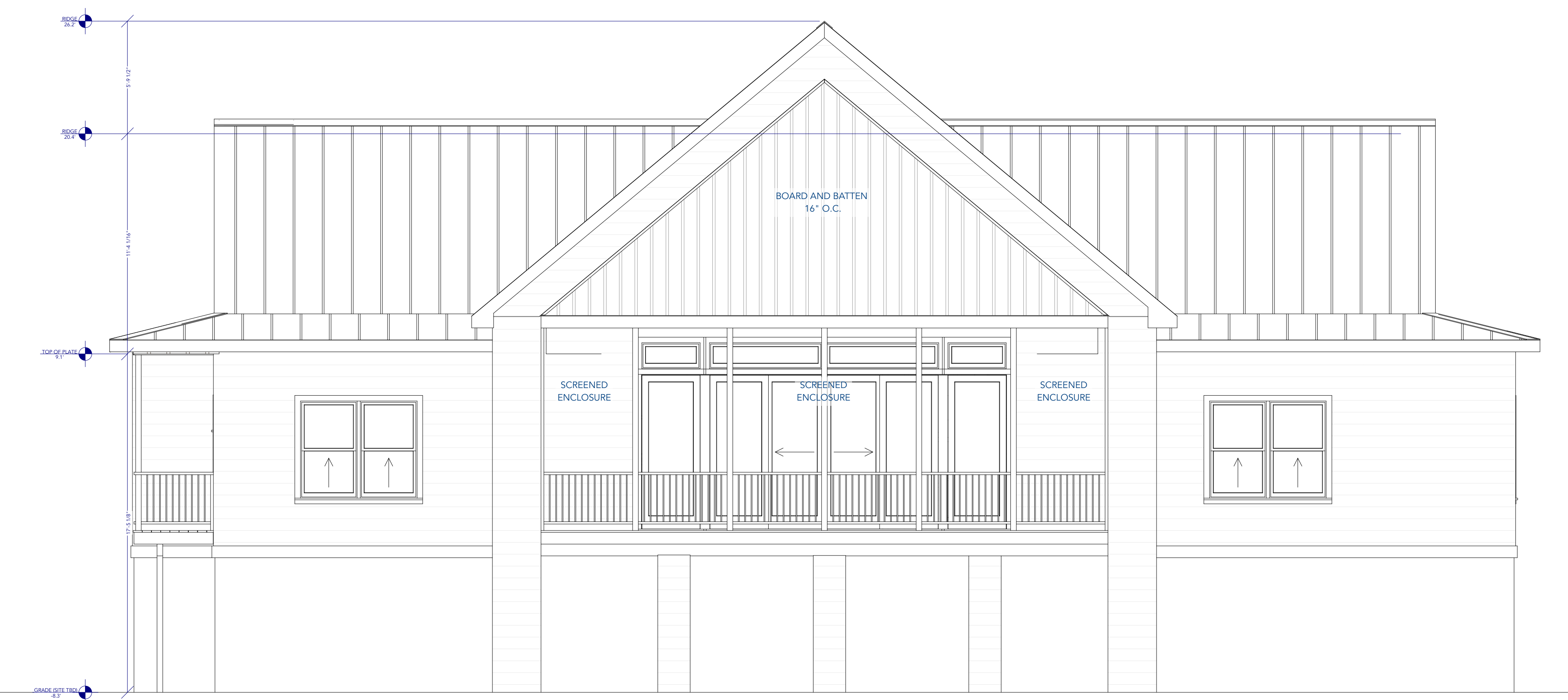
REAR ELEVATION SCALE: 1/4" = 1 FOOT